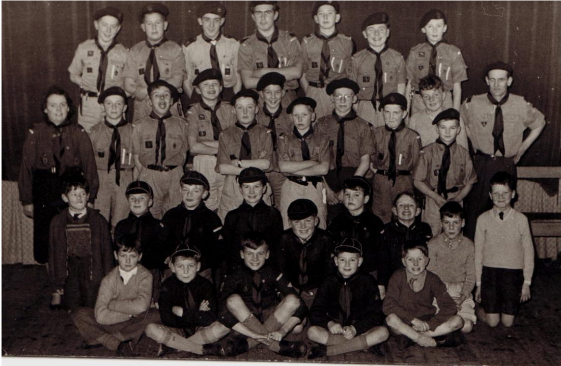
1 st Mochdre Scout Group. 1961 Christmas Party.

In 1954, the 2 nd and 9 th Colwyn Bay groups merged to become the 2 nd Colwyn Bay (1 st Mochdre)